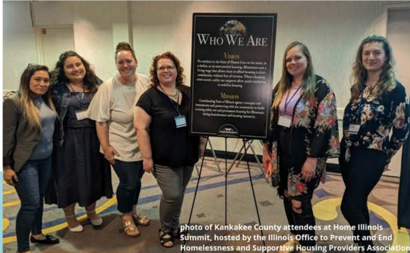
photo of Kankakee County attendees at Home Illinois Summit, hosted by the Illinois Office to Prevent and End Homelessness and Supportive Housing Providers Association

GOAL: dispend funding to social service agencies serving Kankakee residents